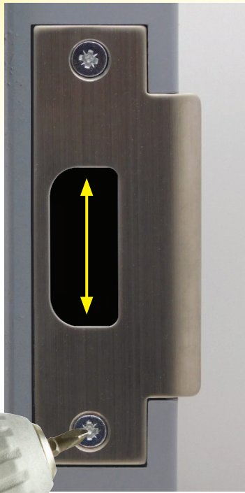
EH 161 latch hole for fluctuations in latch/ height locations.