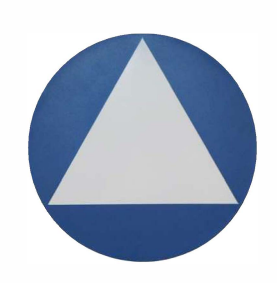
CHS 9 – Title 24, All Gender

CHS 9 should be mounted on the door. Does not have braille